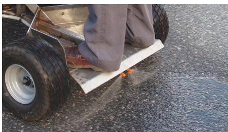
Anti-icing before event