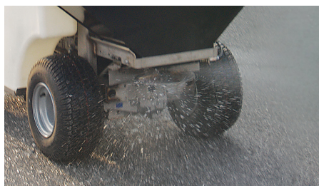
Spreading granular de-icing chemicals